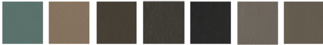
5-537 Caribbean 5-546 Putrice 5-547 Smoke 5-548 Charcoal 5-549 Dark Shale 5-556 Downtown Gray 5-557 City Night