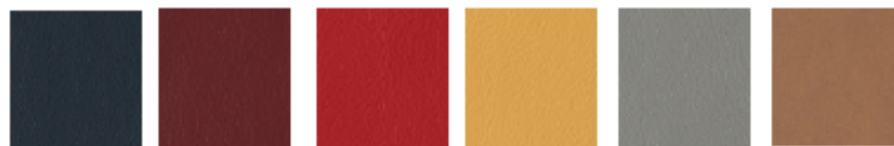
5-600 Midnight Blue 5-603 Sangria 5-604 Swiss Red 5-605 Nordic Yellow 5-606 Sky Gray 5-608 Natural