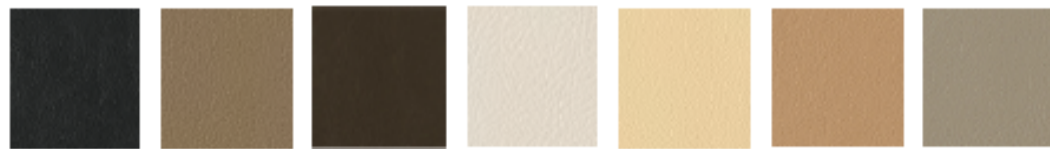
5-507 Black 5-511 Putty 5-519 Hunter 5-520 White 5-521 Ivory 5-522 Parchment 5-534 Pearl