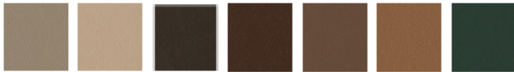
5-559 Ash Gray 5-563 Champagne 5-564 Chestnut Brown 5-565 Dark Sienna 5-566 Earthen 5-567 Desert 5-568 British Green