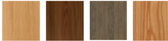
Light Oak LTO Walnut OU Natural Walnut Q15 Natural Oak 678