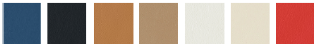
5-579 Paris Blue 5-583 Atlantic 5-592 Camel 5-594 Taupe 5-597 Pure 5-598 Cream 5-599 Poppy