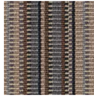
22301 Federal Taupe