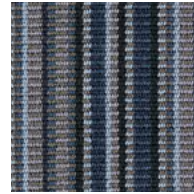
22302 Cool Navy