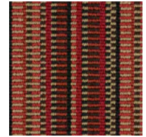
22303 Swiss Red