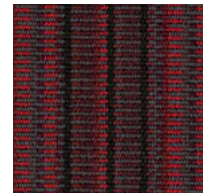
22306 Red Madder