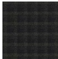
1MP07 Black Onyx