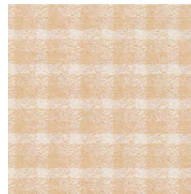
1MP01 Vintage Ivory