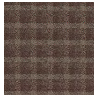
1MP04 Coffee Bean