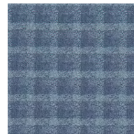
1MP08 Gray Blue