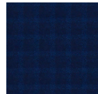
1MP09 Deep Federal