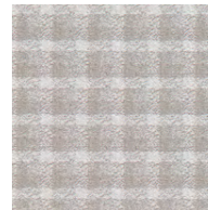
1MP02 Light Gray