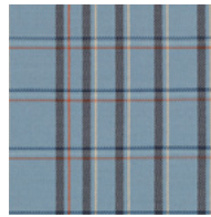
16904 Natier Blue