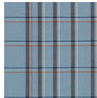
16904 Natier Blue